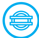
LARGE DOOR OPENING