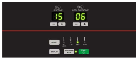
Dual Digital Control